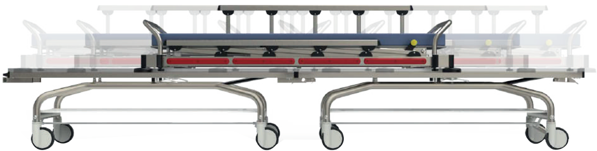
Easy Patient Transfer