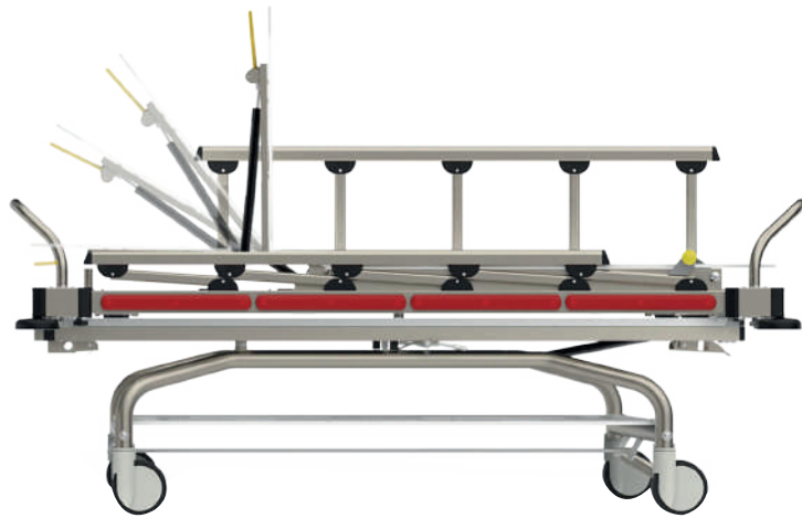
90° Backrest Movement