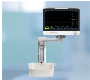
“One Touch” design for easy pole, rollstand and wall mounting