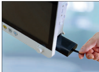
Easy-Release battery pack