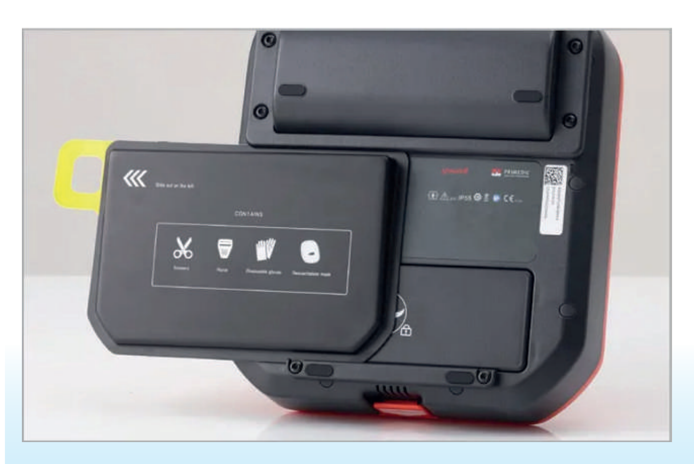
Integrated resuscitation kit