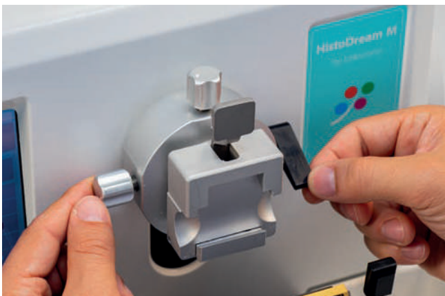
RAPID SPECIMEN EXCHANGE