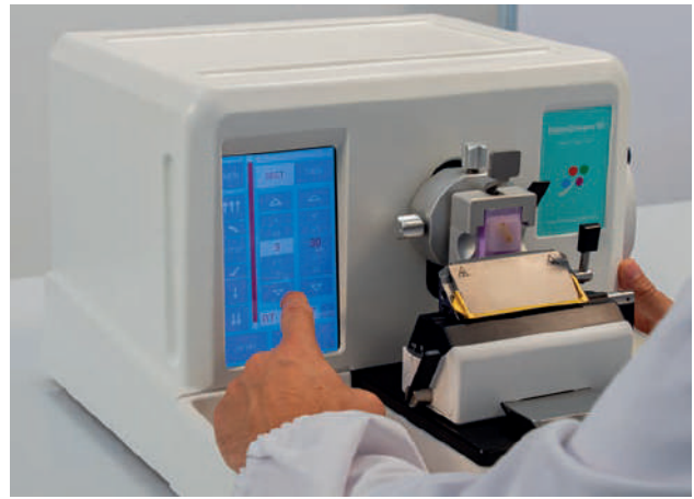
USER FRIENDLY INTERFACE