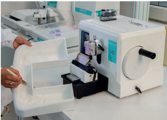
COMFORTABLE OPERATIONS AND EASY CLEANING