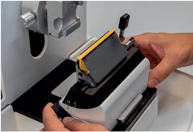
DESIGNED FOR SAFETY